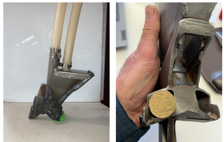
Figure 2: The paired-row seeding tyne Chris has adopted, including a close up with a dollar coin as the scale indicator.

As a result of changing his sowing system, Chris now has the option to use a higher N product, like NPK (27:12:18), when needed, which makes him feel more confident in a challenging season with a dry start.